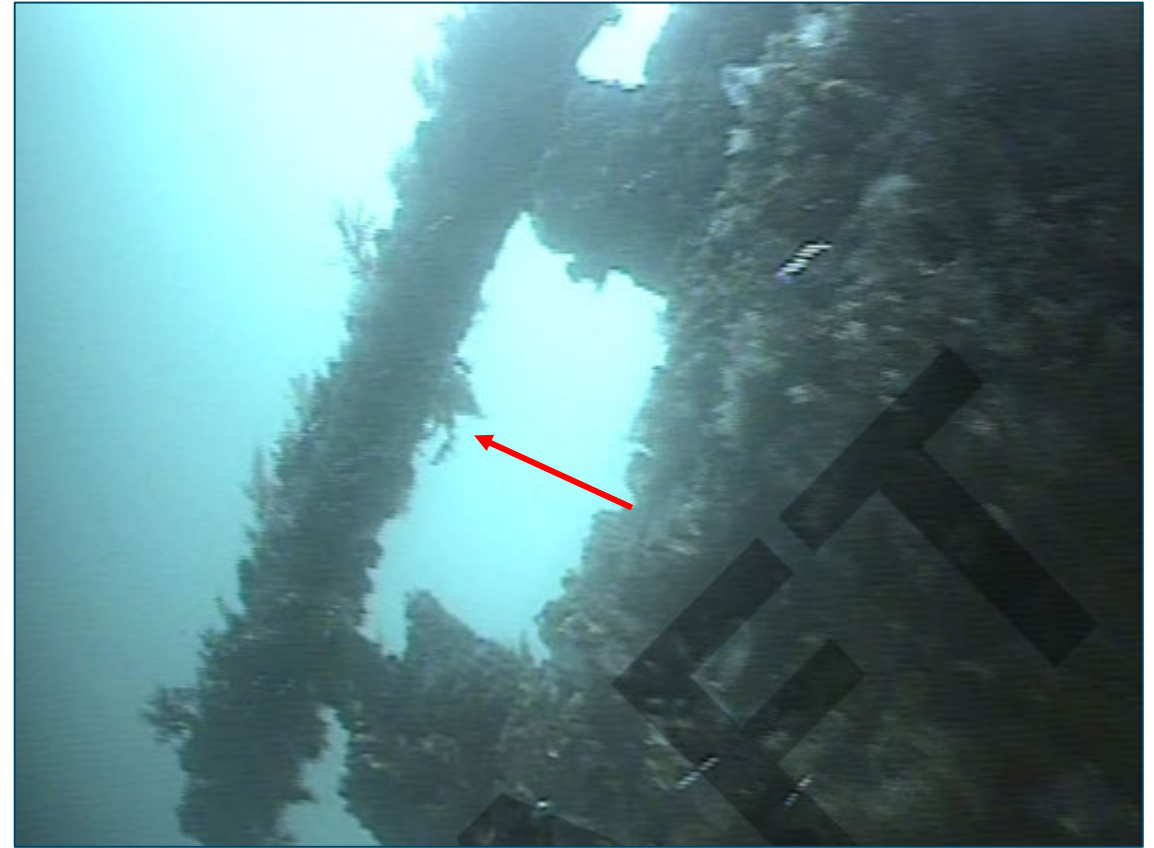
Typical anode with approximately 70% depletion