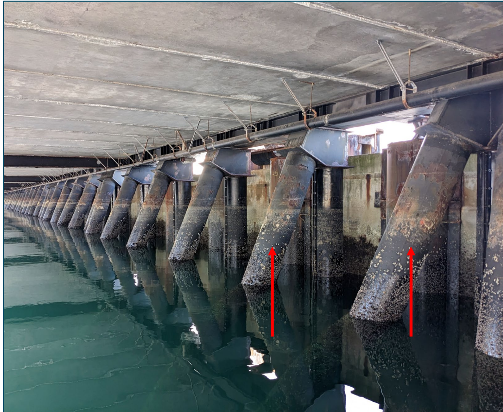
Corrosion and marine growth on battered piles with no pile wrap